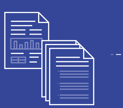
reviews + response